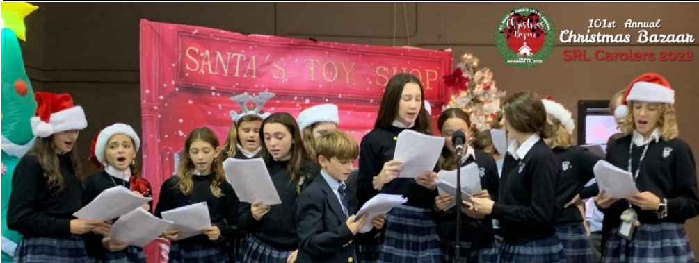
101st Annual Christmas Bazaar SRL Carolers 2022