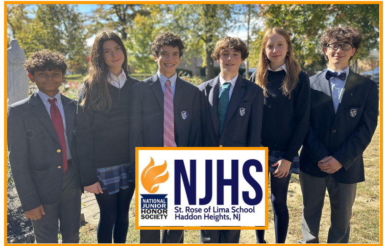
(Pictured from left to right)