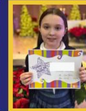
3B - Grace M.