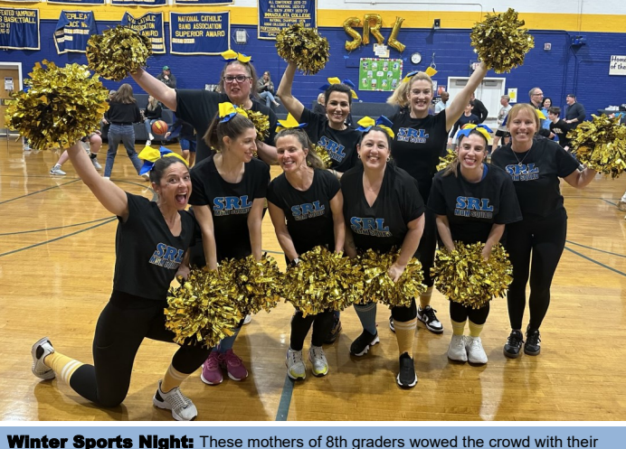
own Cheer routine at Winter Sports Night last week. Many parents also played in the Parents vs. 8th Grade basketball game. What a fun night!

Palm Sunday was the official start of Holy Week. The Catholic Church is rich with many meaningful traditions during Holy Week. I strongly encourage you to try to experience some or all of these beautiful services with your families. Please click here for the Holy Week Schedule.