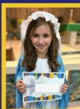
2B - Brooklyn G.