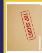
4A - Coming Soon!

Congratulations to our DECEMBER 2024 Students of the Month! Recognized for Excellence in the Virtue of: Gratitude