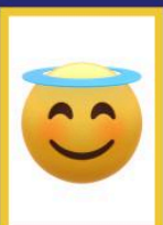
6A - Isabelle G.